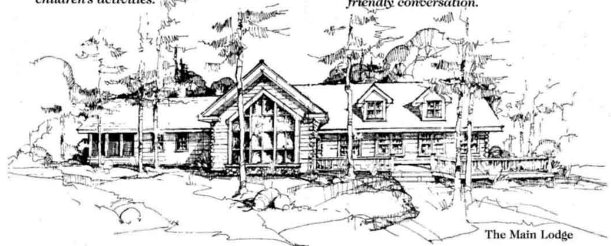
The Main Lodge